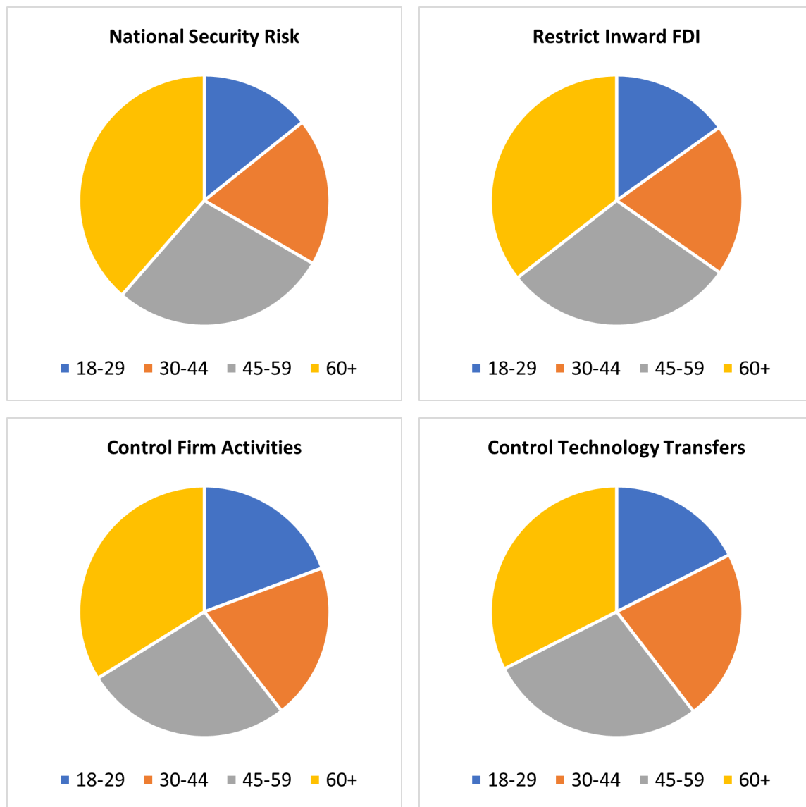
Figure 2. % of Respondents Strongly Agree/Agree

These differences mirror similar age cleavages found in Americans' attitudes toward regulating specific foreign-owned technologies, such as TikTok .